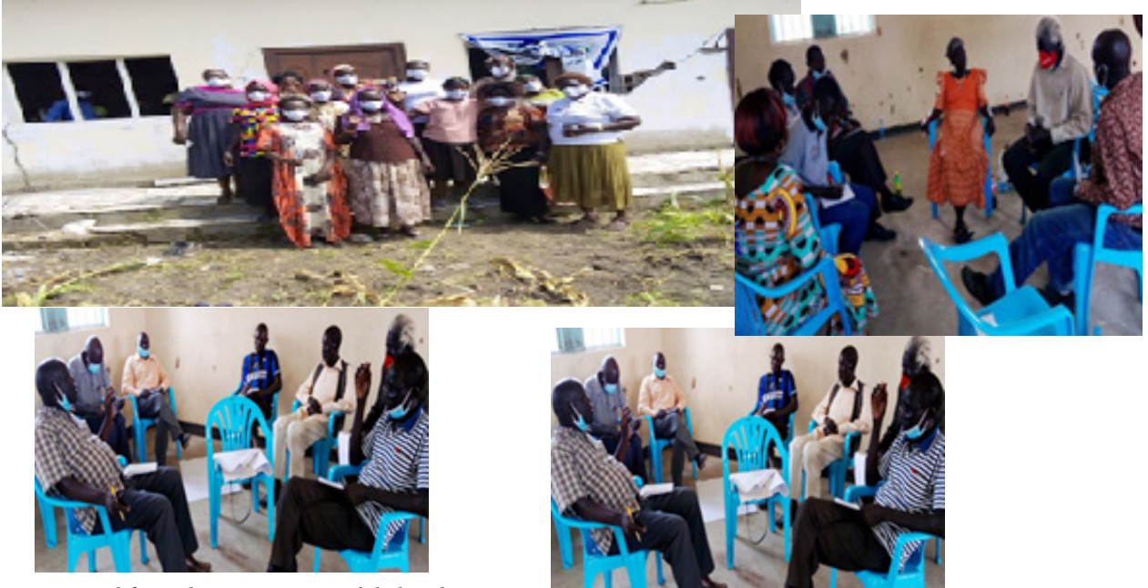
Pictorial from the training in Malakal and Wau.

The training also boosted ICC leaders with knowledge and skills on UNSCR 1325 on gender equality promotion and enabled the youths and women to develop an action plan, empowering them to become agents and ambassadors of peace in their respective locations.