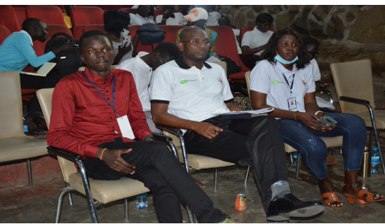
Photo: Youth Attending the Interdational Youth Day Celebration at Nyakkuron Cultural Center

Our main offices are located along Ministries Road, Juba-South Sudan. Visit our Social Media Platforms; Website; www.sscchurches.org | Twitter; @sscchurches | Face-book; South Sudan Council of Churches. We are for the Glory of God