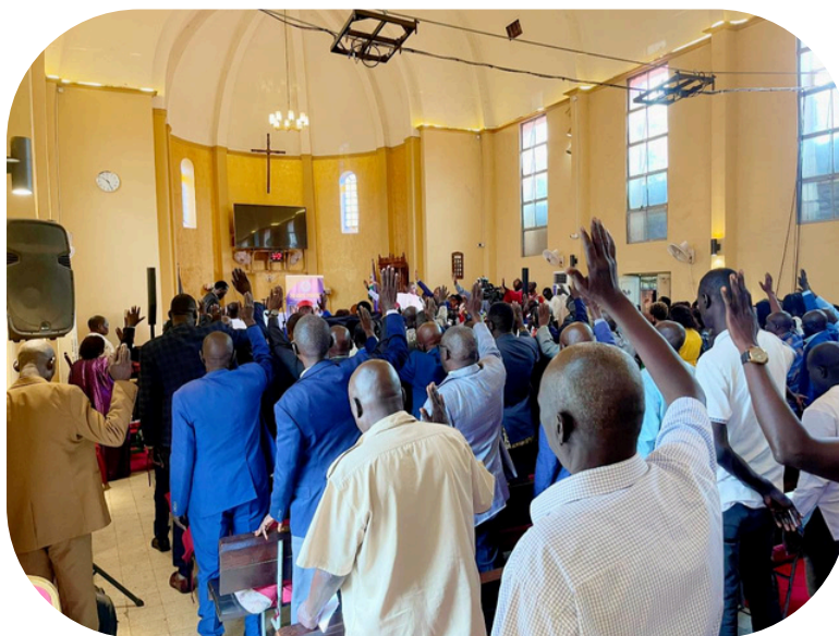
Worshippers during prayer and fasting - all saints Cathedral Juba, South Sudan.

Our main offices are located along Ministries Road, Juba - South Sudan. visit www.sscchurches.org Twitter: @sscchurches Face-book, South Sudan council of churches we are for the Glory of God