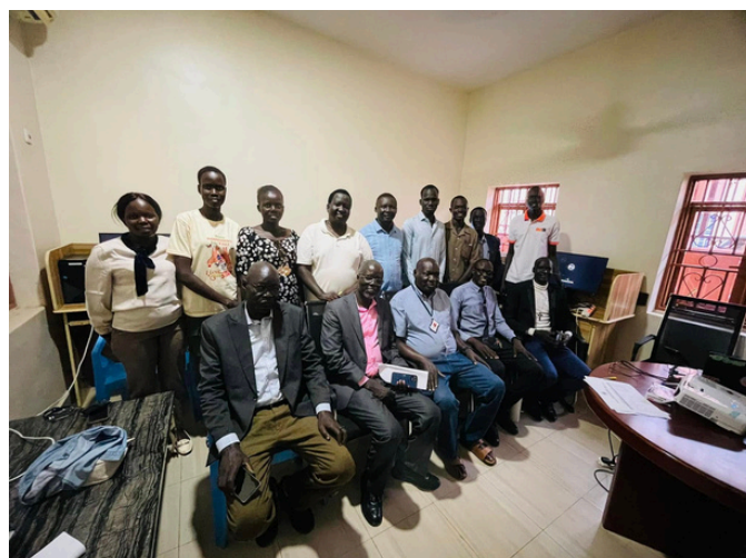
First day of orientation with SSCC senior staff.

Build confidence in preaching the Gospel accurately and fearlessly amidst conflicting doctrines and theological misinformation.