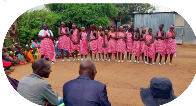
Group photo after the two-day peace dialogue at St. Joseph the Worker, Parish

Our main offices are located along Ministries Road, Juba - South Sudan. visit o www.sscchurches.org Twitter: @sscchurches Face-book, South Sudan council o we are for the Glory of God